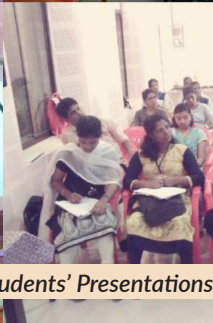
- Students' Presentations