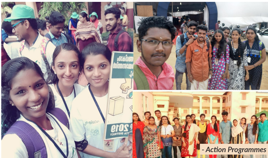
- Action Programmes