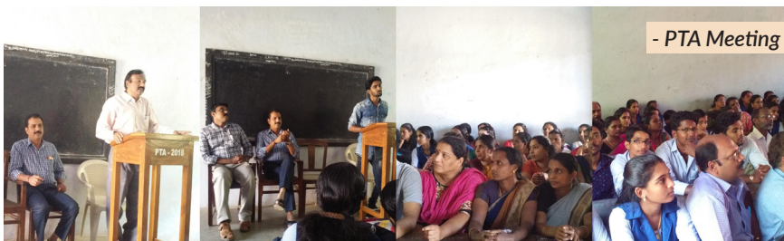
- PTA Meeting